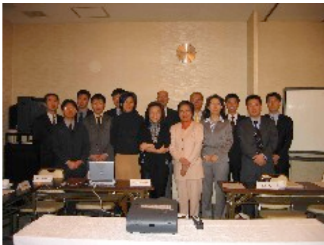
Forum on Development of Common Core Criteria for Low Emission Paints & Toner Cartridges