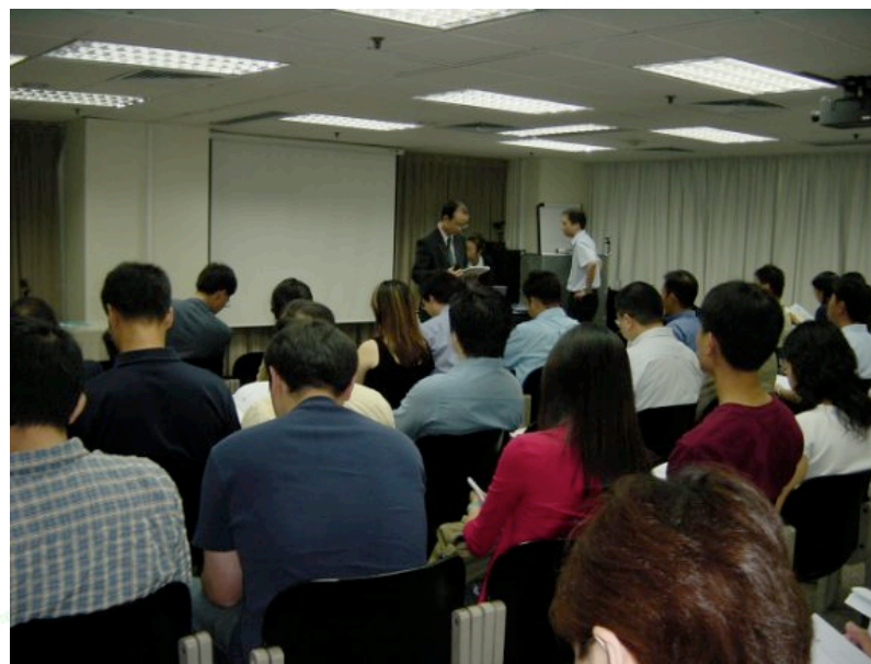
Training Course on Green Procurement