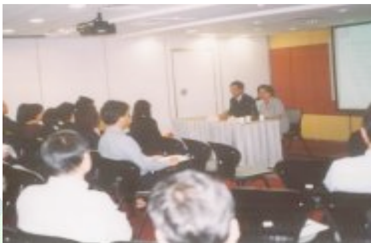
Seminar on “Green Mark Eco-labelling and Government Procurement”